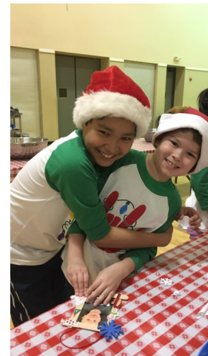
Our friends from the Regional School for the Deaf