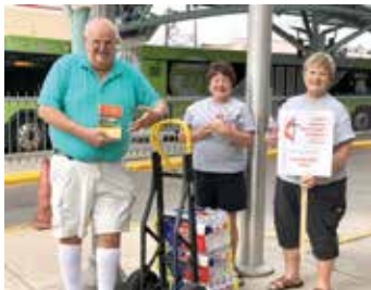
Above: Water for the Thirsty at Bus Station Below: Loving Heart & Hand Teach for America - part of group