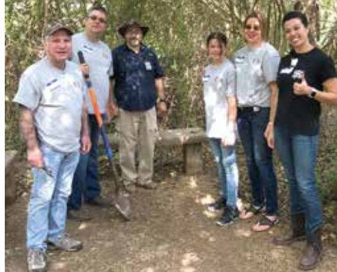
Above: Quinta Mazatlan Partial Crew