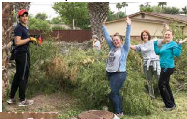
Camp University - Tree Trimming

Just a couple of words of appreciation to pass along to you! "Everything your team did to help our organization (C.A.M.P. University) was so touching. We are so very thankful for your support. There are just not enough words for me to describe my appreciation. Our campus is so very blessed by the hands of Jesus that you came and shared with us. We are in awe and so very blessed to be called the friends of FUMC..." AND, from UTRGV Campus Ministries "The issue of wheelchair entrance for the