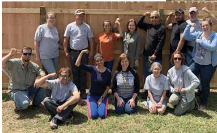
Camp University - New Fence!

(student) center has been a major source of sadness for us, since we built the building in 1994. Over the years, students in wheelchairs have had extreme difficulty getting into our building. Some just gave up...the work of FUMC McAllen is an answer to prayers! And it looks beautiful. Thank you is insufficient to show our appreciation."