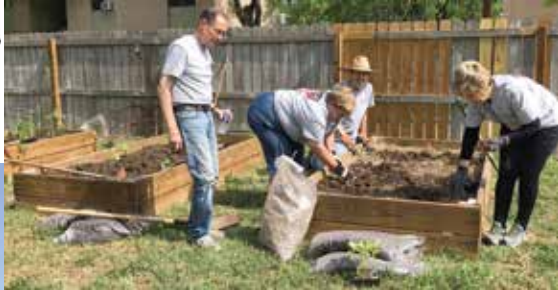
Above: Salvation Army Raised Garden Crew