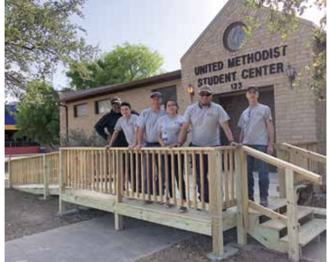
Right: UTRGV UM Campus Ministry Part of Crew on new deck with steps and ramp Below: UTRGV UM Campus Ministry Confirmation Group with parents and sponsors