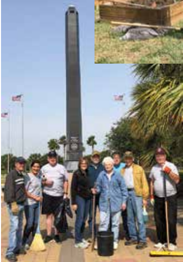
Above: Veterans War Memorial