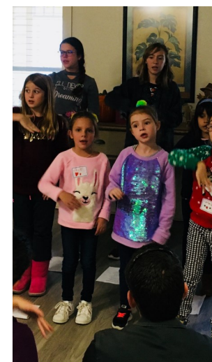
WOW Kids singing for their friends at Bridges Assisted Living

Train children in the way they should go; when they grow old, they won't depart from it. Proverbs 22:6