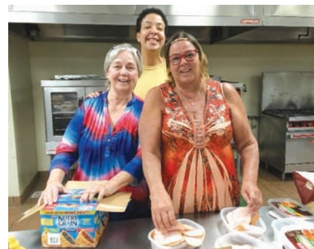
Preparing meals for Emily's Meals, the ministry which feeds more than 40 homeless people every day. FUMC McAllen has committed to preparing and delivering these meals every other Thursday. Come see!