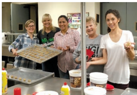
Baking cookies for Kairos prison ministry....LOTS of cookies!