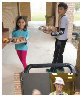
Yummy donuts for all of the hardworking people building the new sanctuary.